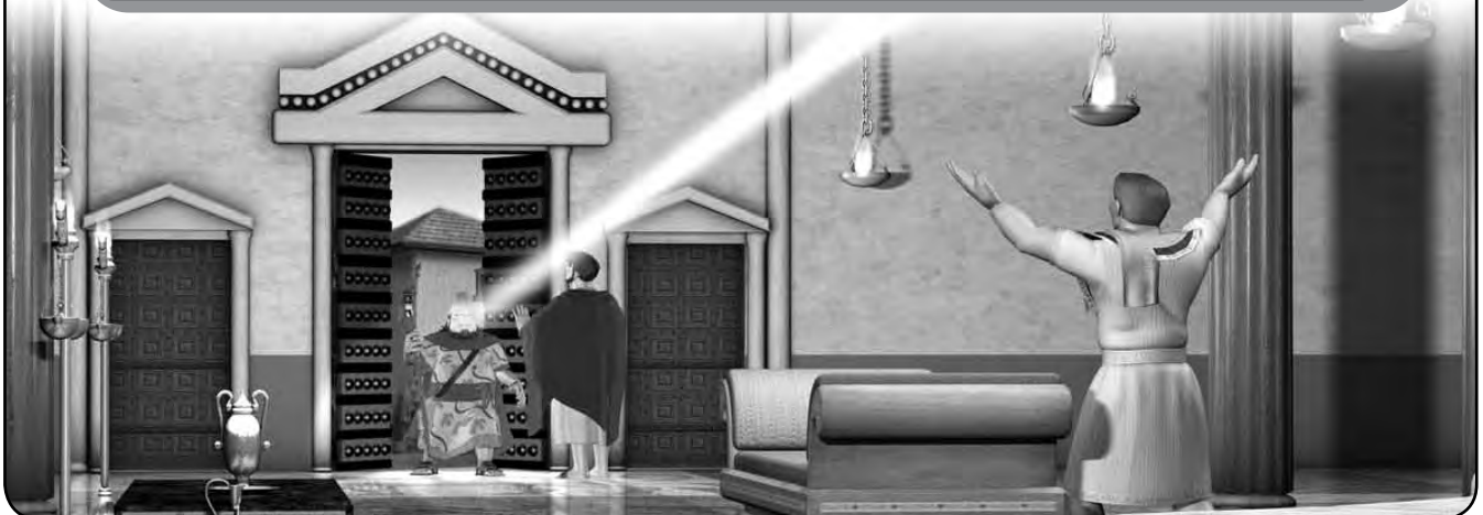
Paul shows the power of God